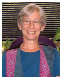
Sandra Lipsitz Bem

H ospicare is pleased to announce the establishment of the Sandra Lipsitz Bem Lecture Series on Compassionate Care and End-of-Life Issues. Through this yearly lecture, given by outstanding professionals dealing with end-of-life issues, we hope to expand our community's awareness and understanding of death, dying, and the possibilities and limits of contemporary medicine.